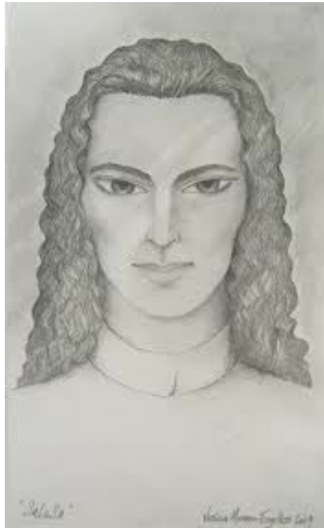
Purported Depiction of SaLuSa of Sirius